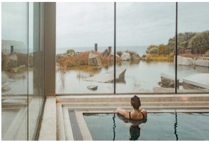
Wellness retreats in Cornwall January 9, 2023