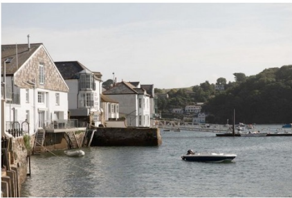
A Guide to Fowey, Cornwall January 13, 2023