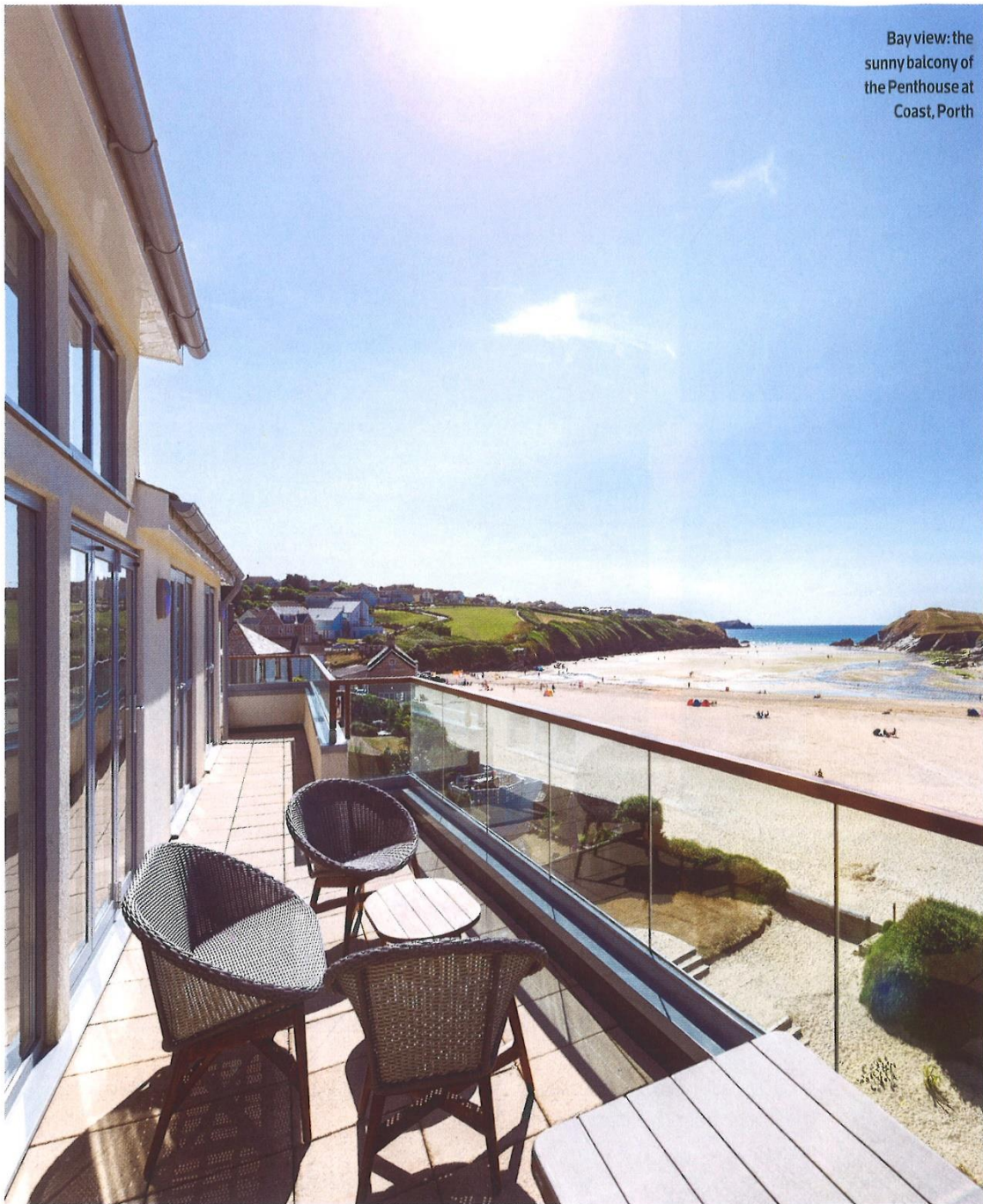
Bay view: the sunny balcony of the Penthouse at Coast, Porth