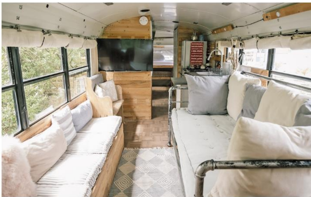
The converted school bus is equipped with wood burners and hot showers to keep things cosy

The details: The bus sleeps two adults and two children, while the cottage has space for two adults and one child. From £160-£200 a night; kiphideaways.com