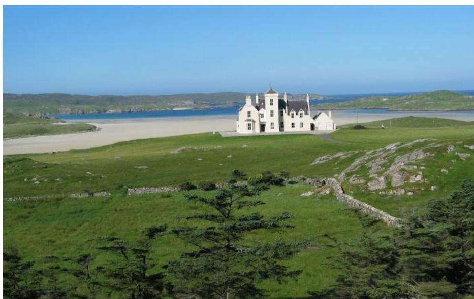
Most rooms at this Isle of Lewis sporting estate have striking mountain or sea views

The details: Sleeps 15. From £800 per night; stayonedegree.com