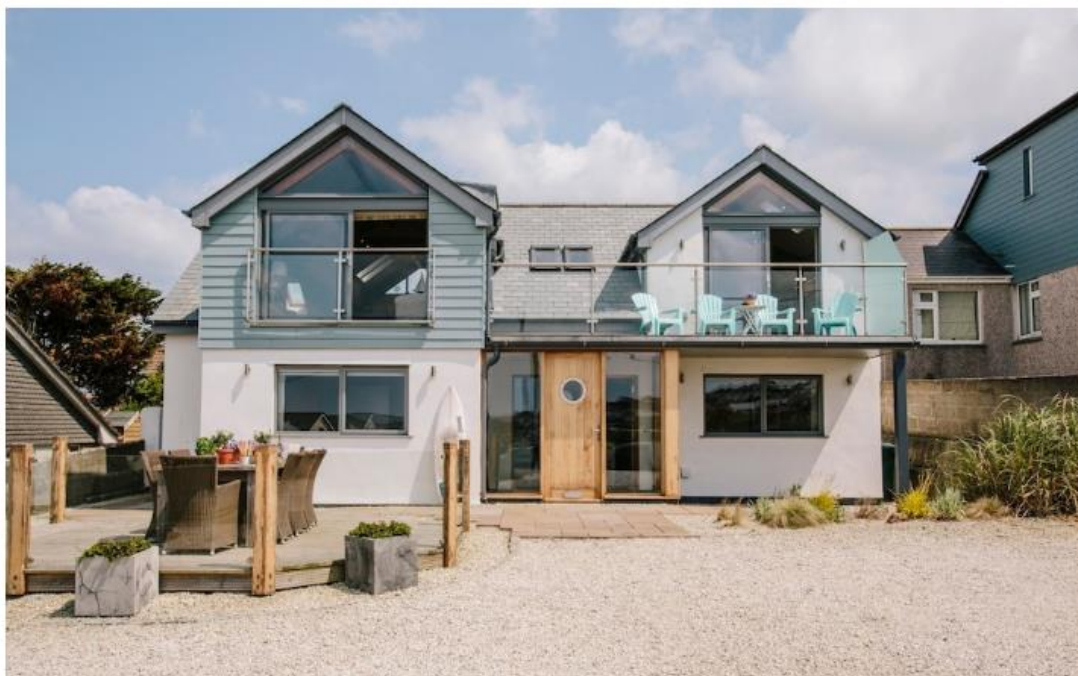
Cothelstone is a modern coastal property just five minutes' walk from Polzeath Beach, where politicians like to stretch their legs

The details: Sleeps eight. A week's stay from £2,435; latitude50.co.uk