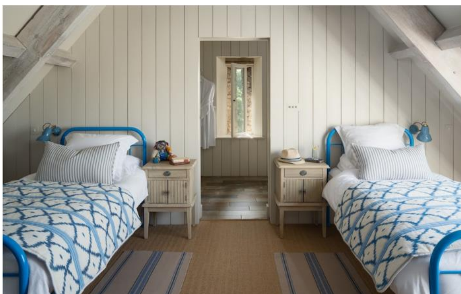
Bedrooms at The Polo Farm are more like hotel rooms

The details: Sleeps 10. A week's stay from £10,000; uniquehomestays.com