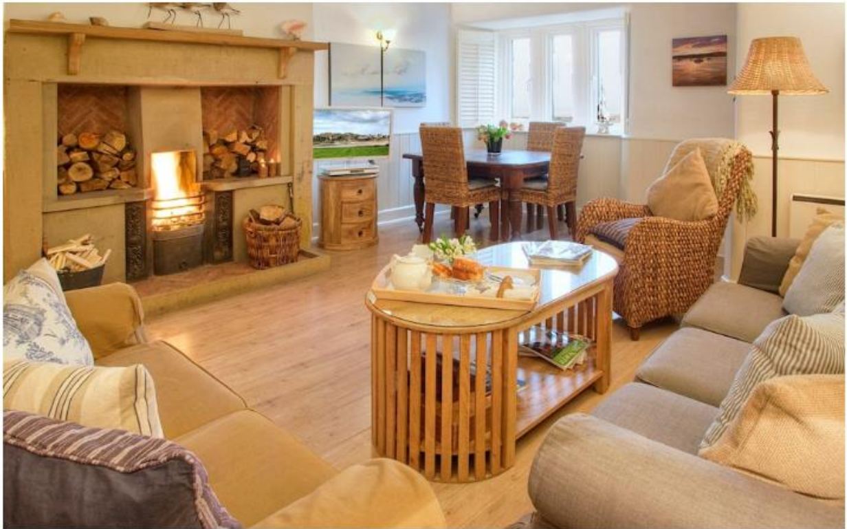
This pair of 17th-century sandstone cottages overlook the beach in the village of Alnmouth

The details: Each cottage sleeps four. A week's stay from £1,450; sawdays.co.uk