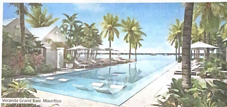
Veranda Grand Baie, Mauritius

At the community-minded Azura Benguerra lodge on Mozambique's dreamy Bazaruto Archipelago, just 20 thatched beach villas complement an array of activities from crocodile safaris to dives round pristine reefs. Hefty 45 per cent discounts are available on stays until March 31 to anyone booking this month. Seven nights' full board from £2,563pp, including helicopter transfers (aardvark-safaris.com). Fly to Maputo.