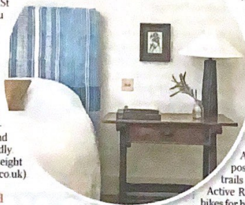
The Bradley Hare, Wiltshire