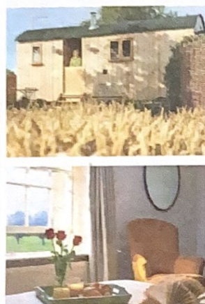
Above: the Gardener's House in Bedfordshire. Top: the Shepherd's Hut near Ingelton, Co Durham

THE SHEPHERD'S HUT CO DURHAM Fingers crossed – by the end of May it should be warm enough to use the alfresco bath at the Shepherd's Hut near Ingelton. Inside there's also a hot shower and a wood-burning stove, but just imagine: you've spent the day hoofing through the North Pennines, or marvelling at Durham's cathedral, and now, with a long summer evening ahead, you can fill the tub, raise a glass to Her Majesty and listen to the birdsong. Dinner is best taken on the sun deck.