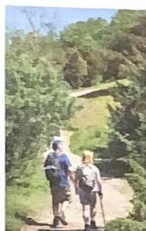
Left: Ultimate Harbourside in Ilfracombe. Top: First Light in north Cornwall. Above: head off for walks from Pele Tower in Cumbria