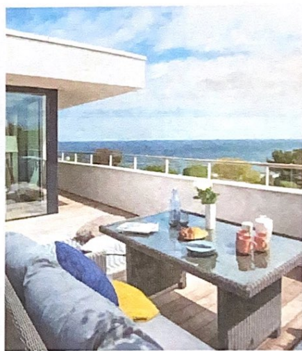
Above: a sun deck at 4 The Bay on the Berwickshire coast. Top: Dinyan in Cornwall. Below left: the living room at Beudy Aeron, near Aberaeron. Below right: a bedroom at Brick House Farm in Herefordshire