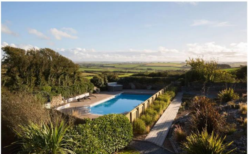
Guests at The Tractor Shed have access to a shared heated outdoor pool

From £550 a week ( latitude50.co.uk ; 01208 869090)