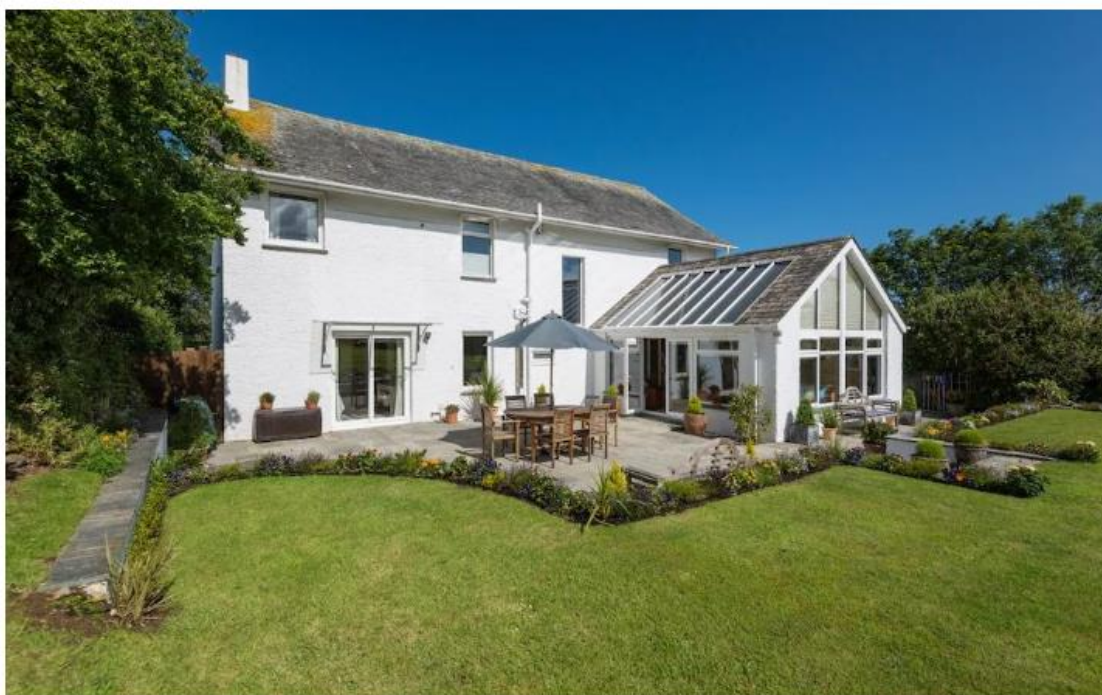
Gwel Mor has a garden with a croquet lawn and terraces front and back