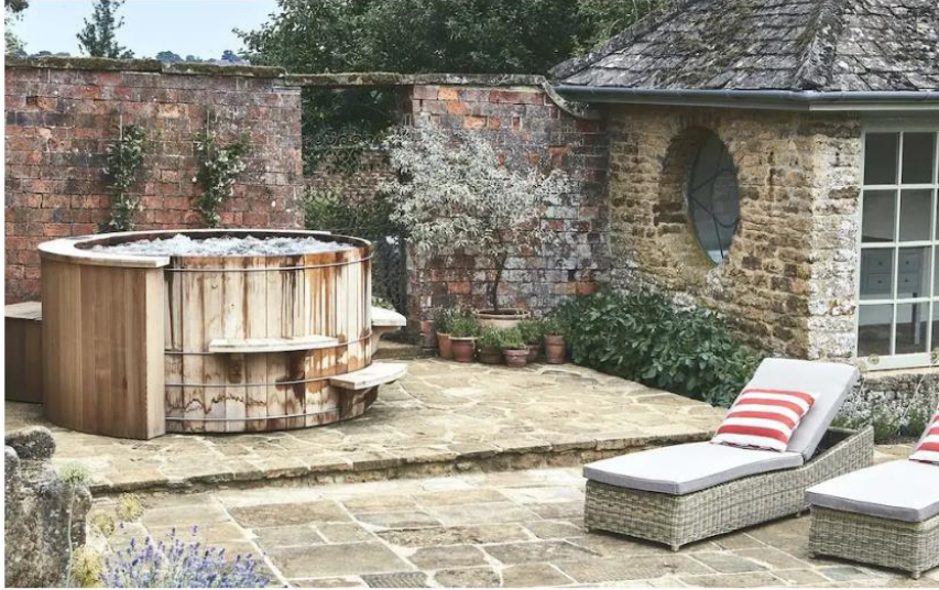
May hot tubs be cedarwood and tasteful in the second summer of staycations

Fortune favours the efficient. With the Great British staycation reaching unprecedented levels of popularity this year, there's barely a cottage or camping pitch left in the country for summer breaks; all snapped up by early-bird bookers many months ago. If you're reading this, it's safe to assume you're not one of those early birds. But rejoice, all ye latecomers! A raft of new holiday rentals have been launched this year, some even now getting their final lick of paint – and as such, still have availability even in those hard-to-find weeks of high summer and school holidays. So whether you're after a beach escape, a romantic rural bolthole or great-value party houses for the big post-lockdown get-togethers we've been dreaming about, here are 25 great new holiday digs, from stately homes to seaside yurts.